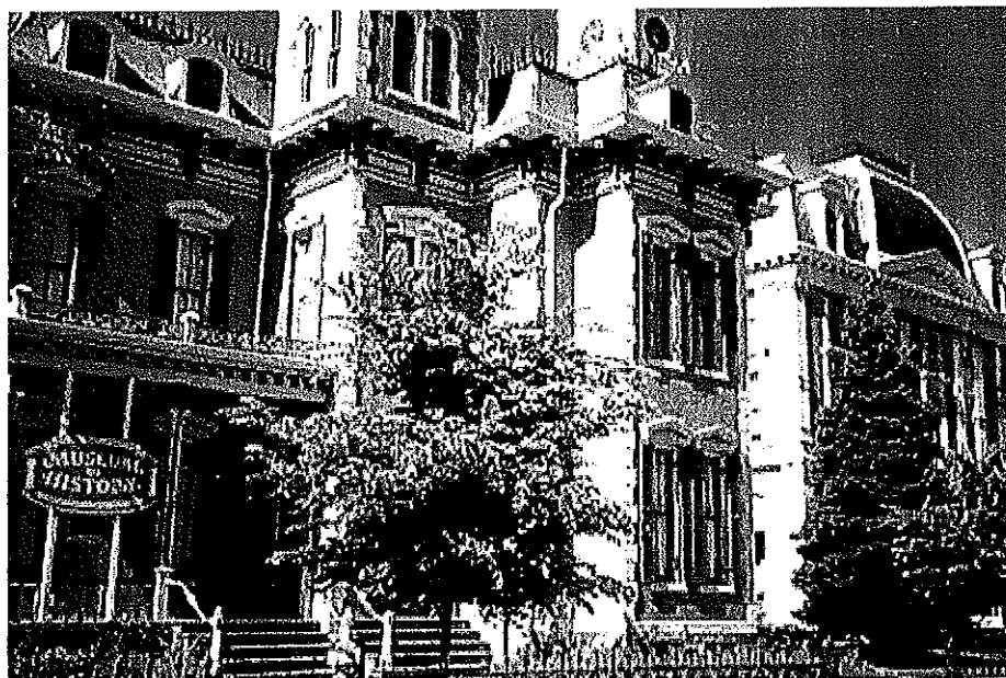
An accessible side entrance was added to this historic facility.

listed or eligible for listing in the National Register of Historic Places or properties designated as historic under State or local law. Structural changes to these facilities that would threaten or destroy the historical significance of the property or would fundamentally change the program being offered at the historic facility need not be undertaken. Nevertheless, a city must consider alternatives to structural changes in these instances -- including using audio-visual materials to depict the inaccessible portions of the facility and other innovative solutions.